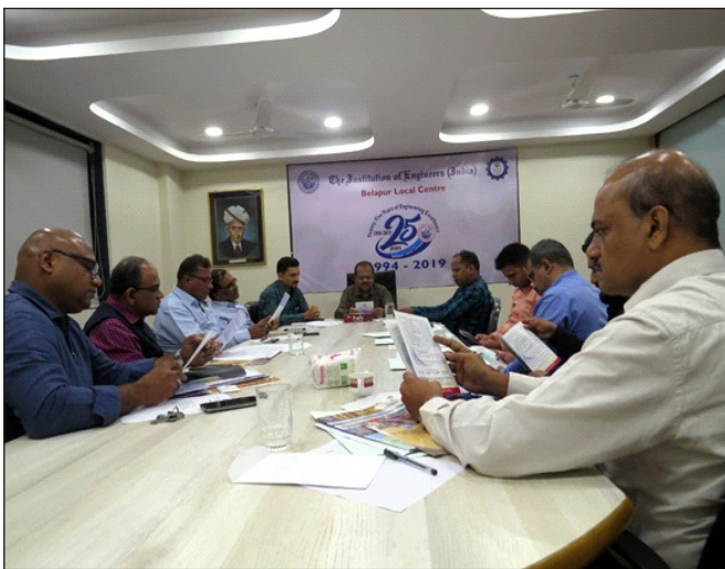
IEI BLC industry meet held on 10th Jan 2020