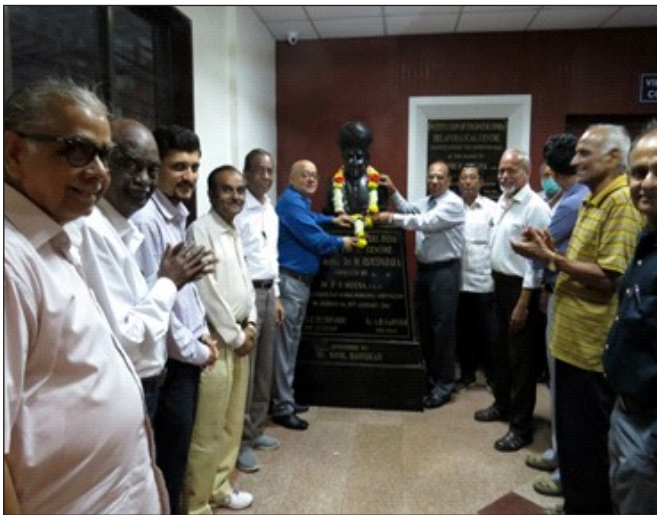
Garlanding of Sir MV statue