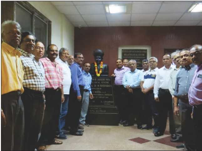
Garlanding of Bharat Ratna Sir M. Visvesvaraya