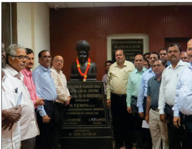
Garlanding of Dr. M. Vishveswaraya Statue.