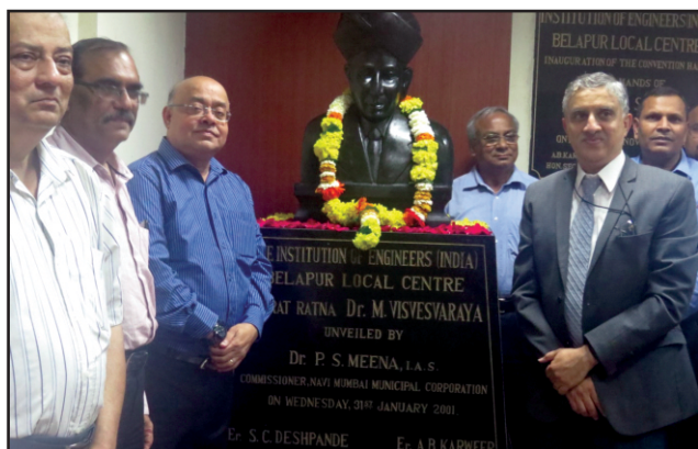
Garlanding Sir Visvesvaraya Statue