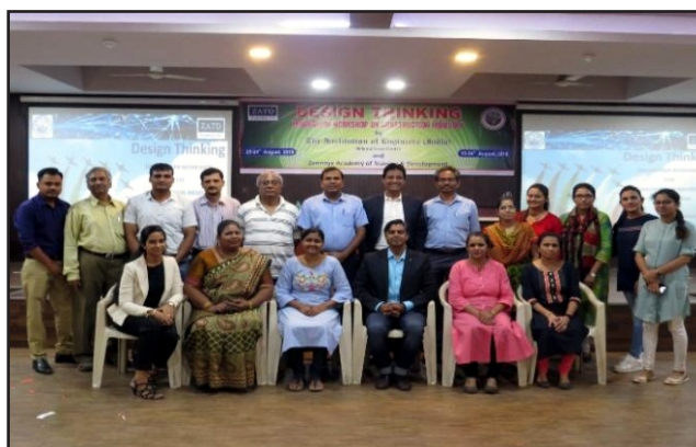
Participants of workshop