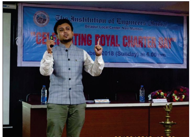
Celebration of Royal Charter Day