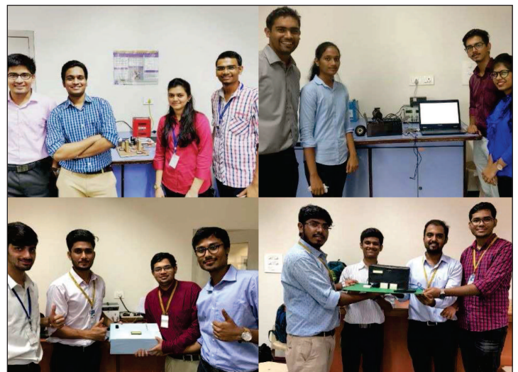
Participants of mini project competition