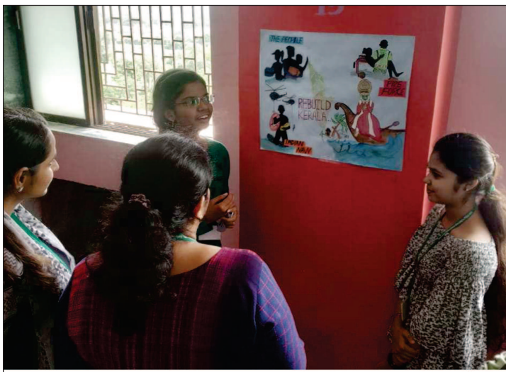
TE electrical students explaining about their poster