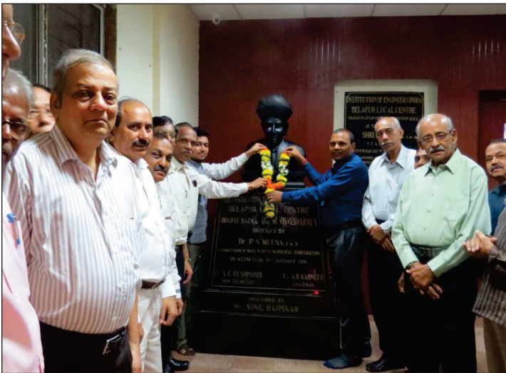
Garlanding of Sir Visvesarray Statue