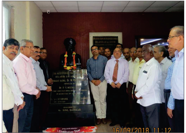
Celebration of Engineers Day